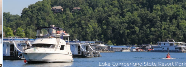
Lake Cumberland State Resort Park